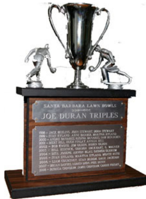
JOE DURAN TRIPLES