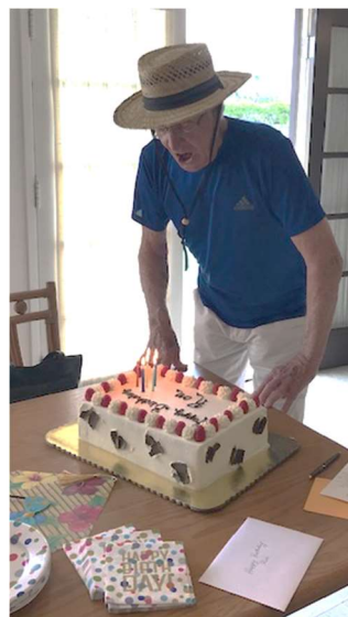
Blowing out candles