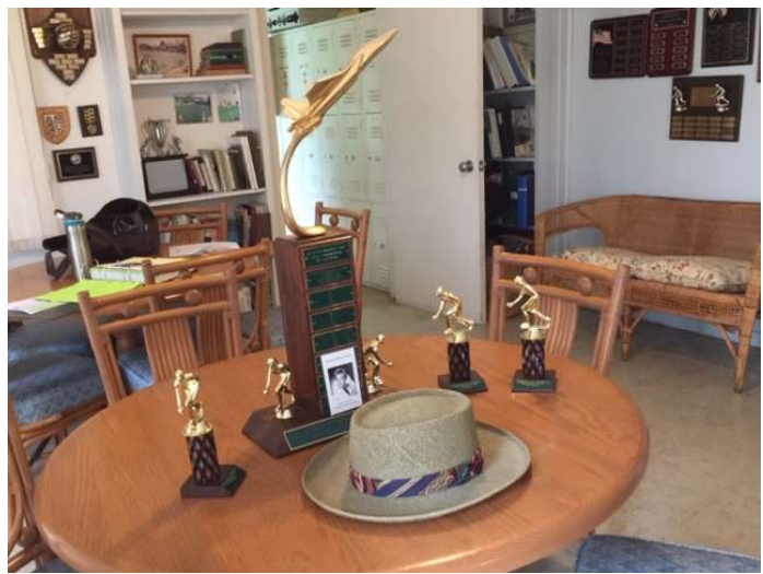
Trophies for tournament